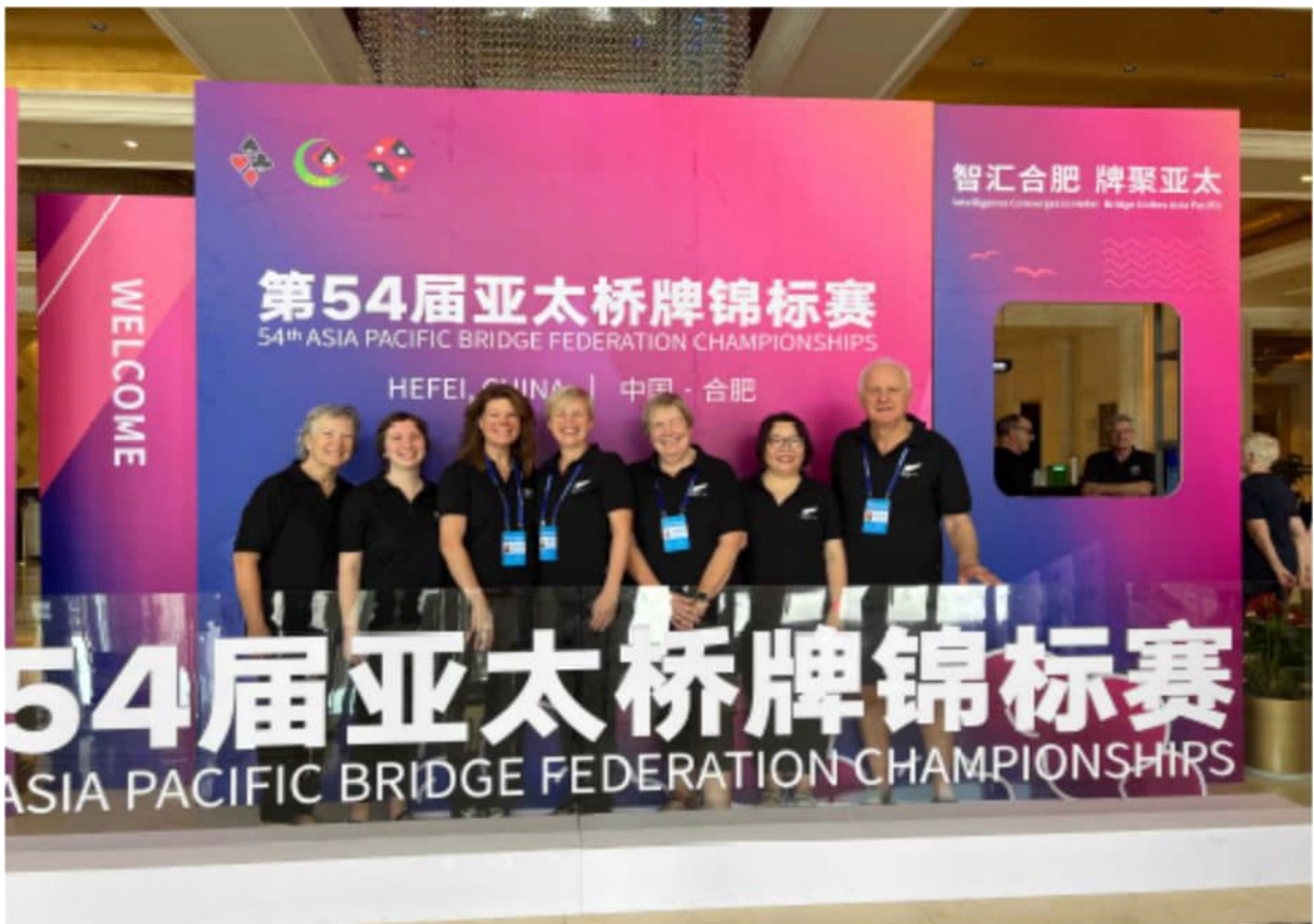
The Women's Team at Hefei