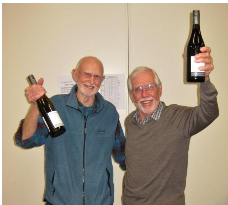
Two delighted Presidents sharing the podium.